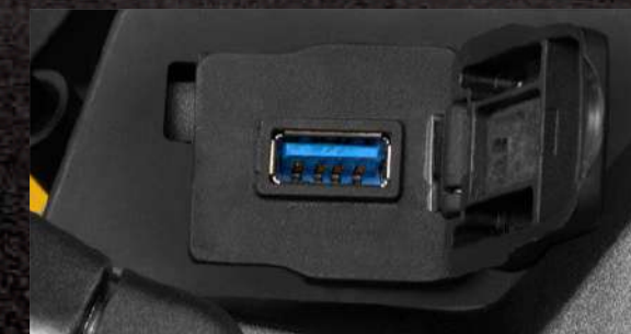
USB FAST CHARGING