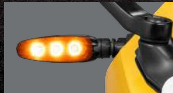
LED WINKERS THAT ADD FLAIR AND FUNCTIONALITY