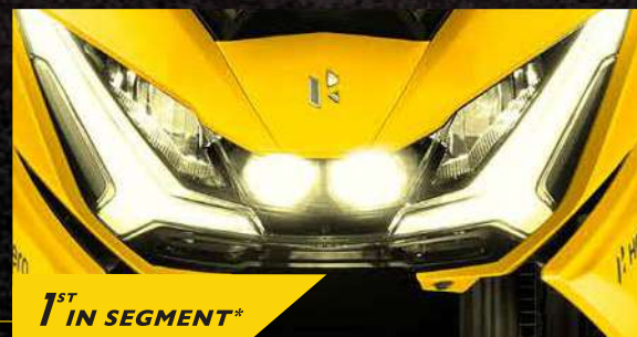
CLASS-D LED PROJECTOR HEADLAMP WITH INTELLIGENT ILLUMINATION